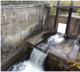
Alcott Street Dam Structure.

The Michigan Department of Environmental Quality and the City of Kalamazoo hosted a meeting on February 1 to explain plans for removal of the Alcott Street Dam across Portage Creek. Speakers from the US Fish & Wildlife Service, the DEQ and two contractors described why they were undertaking the work, what would be done and when it would be completed.